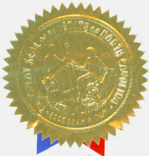
BEVERLY EAVES PERDUE

NOW, THEREFORE, I, BEVERLY EAVES PERDUE, Governor of the State of North Carolina do hereby proclaim November 2012, as " RADIATION SAFETY MONTH " in North Carolina and commend its observance to all citizens.